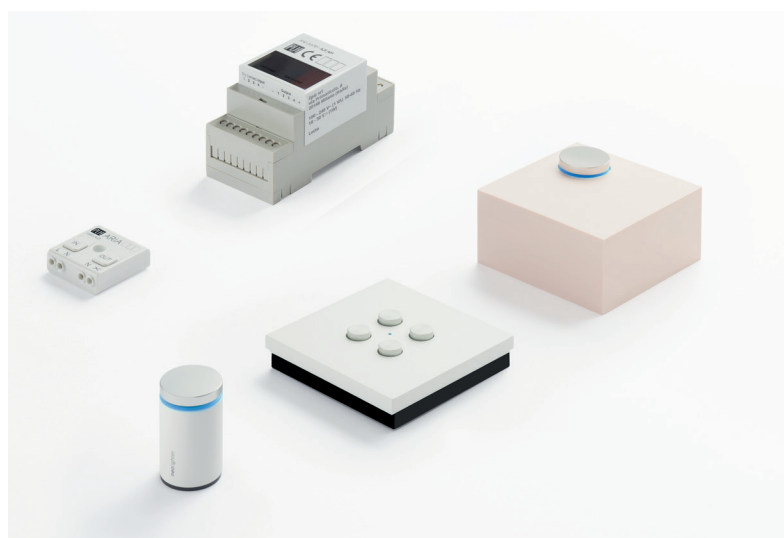
PLH® Aria system

The Bold Nero Lighter Version Will also be presented at Euroluce, a black opaque body and a