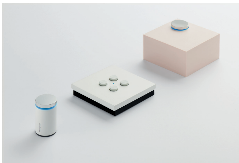
PLH® Aria devices

Neo Lighter, MakeUp, Brick with Neo Lighter, Dimmer and Jellyfish