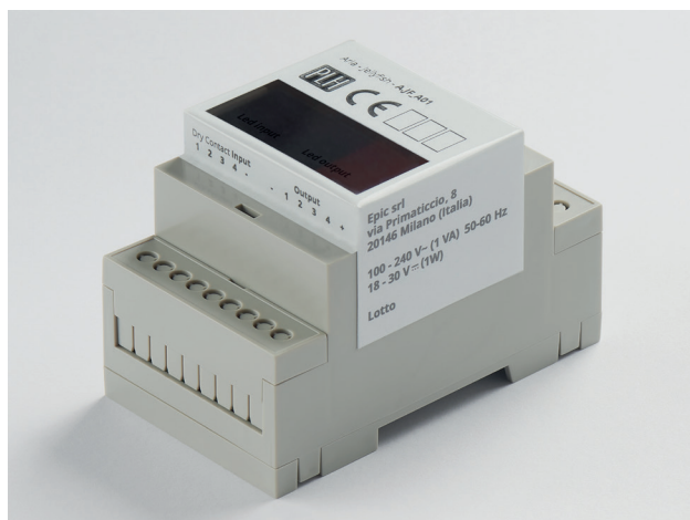
PLH® Aria collection