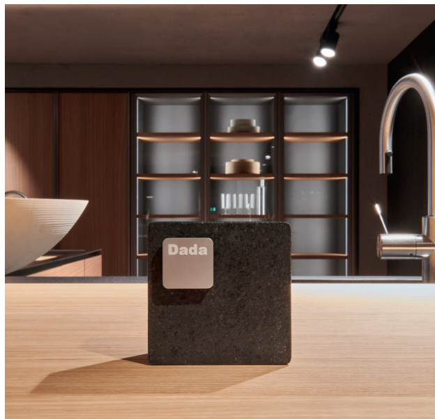
PLH® Aria collection

For Epic, 2019 represents a turning point and a flywheel towards new collaborations, new finishings and new products that are at a advanced fase of developement and will be released within the next semester.