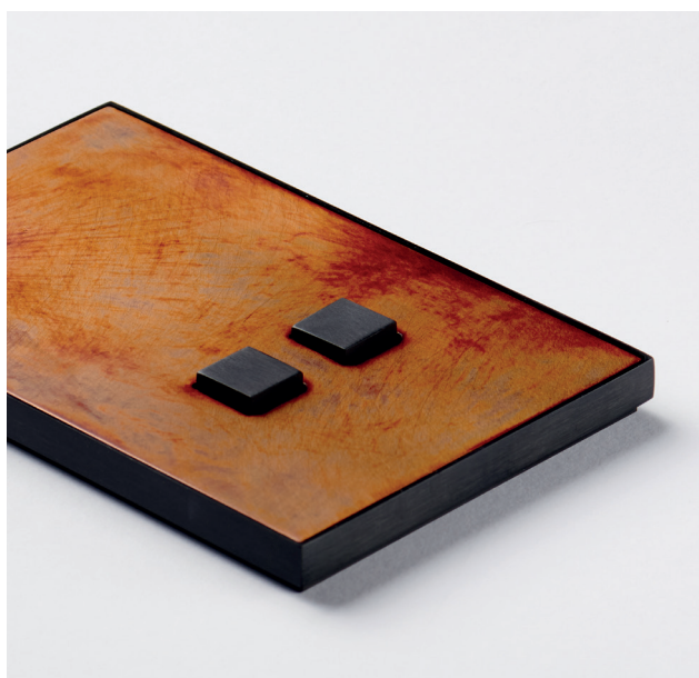
PLH® Skin collection

The new kitchen collections presented at the Milano Design Week are already equipped with a smartphone lighting control system from Casambi, will also be provided with a switch plate which is coherent with the Belgian designer and