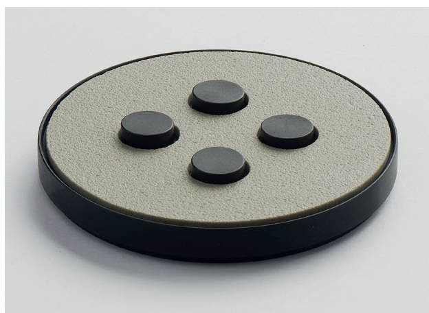
PLH® Skin collection insert in Lapitec